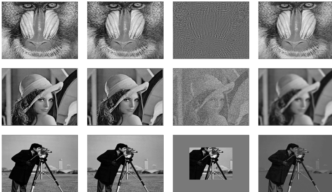
Fig. 1. First column: test images, Second column: watermarked images, Third and Fourth column: attacked watermarked images

2. Multiplication of these coefficients by 2D complex chirp \exp[j(a_1x^2/2 + a_2y^2/2 + a_3xy)] .